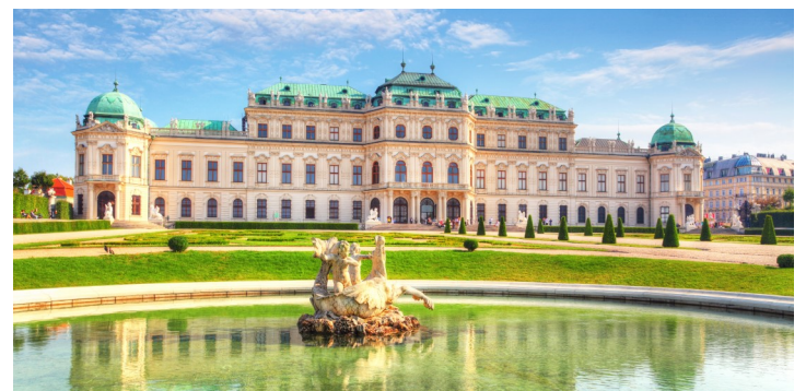
Belvedere Palace ~ Vienna

Morning sightseeing begins at Heroes Square, decorated by several impressive statues. Continue to the old inner city of Pest then proceed to the remains of Buda Castle, Fisherman's Bastion, and scenic Gellert Hill, offering panoramic views of the entire city. (B,D)