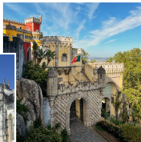
Pena National Palace, Sintra, Portugal