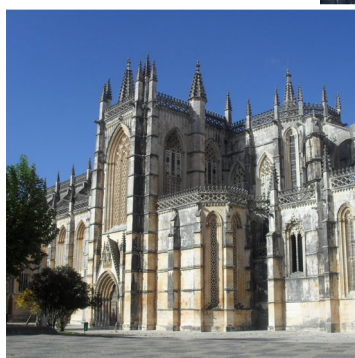
Monastery of Santa Maria da Vitória, Batalha, Portugal