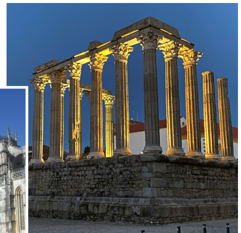
Évora, Portugal, a UNESCO World Heritage Site

Pilgrimage Price: $3,400 per person double or triple