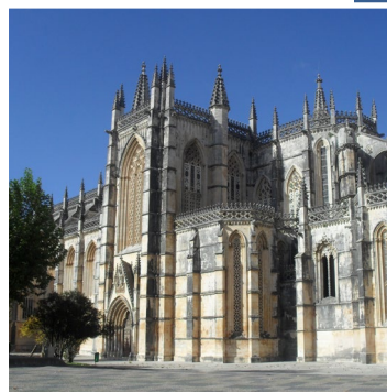
Monastery of Santa Maria da Vitória, Batalha, Portugal